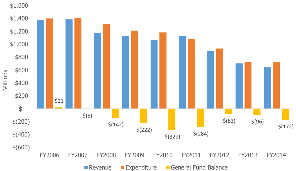
Chart 2 Total General Fund Revenue, Expenditures, and Year-End Balance: FY2005 to FY2014